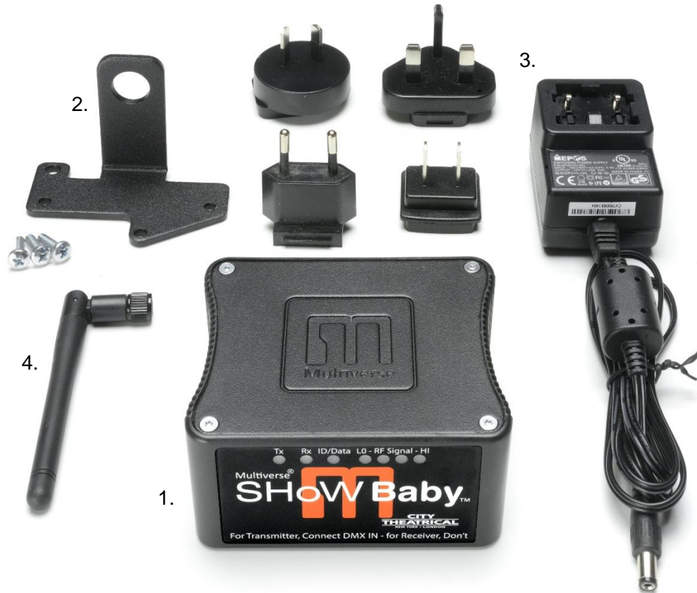
Figure 3: What's Included