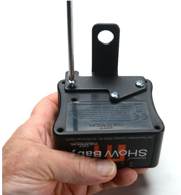
Figure 2: Attaching the Mounting Bracket

Mount the Bracket on the Multiverse SHoW Baby using the three provided 8-32 x ½" pan head Philips screws.